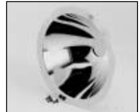
L4.77815.E Reflector Reflektor