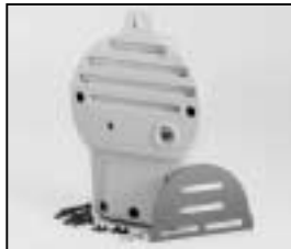
L4.77933.E Rear casting Rückteil