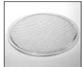
L4.77833.E S-flood lens clear 50° (honey-comb) "red" 130mm S-Floodlinse klar 50° (Bienenwabe) "rot" 130mm