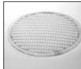
L4.77831.E Flood lens 20x45° (large rectangle) "green" 130mm Floodlinse 20x45° (großes Rechteck) "grün" 130mm