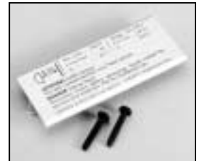
L4.77802.E Bottom plate Bodenblech