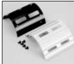
L4.77837.E Top cover cpl. Deckel kpl.