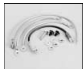
L4.77173.E Connecting wire Verbindungslitzen