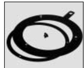
L4.70478RE Lensring s-flood "red" Linsenring S-Flood "rot"