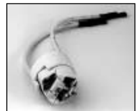
L4.73353.E Lamp holder Lampenfassung