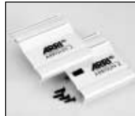
L4.77844.E Set of side panels Set Seitenbleche