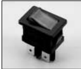
L4.77267.E On/Off switch Wippschalter