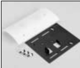
L4.77843.E Intermediate panel Zwischenblech