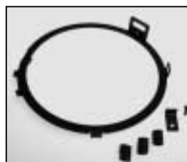
L4.80436.E Protective glass holder for 2 protective glasses 2,75mm Schutzglashalter für 2 Schutzgläser 2,75mm