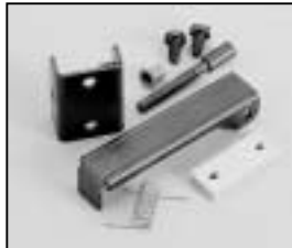
L4.77814.E Top latch Verschlussklaue