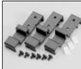
L4.77847.E Set of accessory brackets Set Torhalter