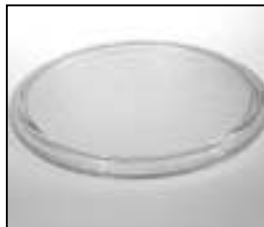
L4.77829.E N-flood lens 10x20° (small rectangle) "black" 130mm N-Floodlinse 10x20° (kleines Rechteck) "schwarz" 130mm