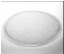
L4.77833SE S-flood lens frosted 50° (honey-comb) "silver" 130mm S-Floodlinse gefrostet 50° (Bienenwabe) "silber" 130mm