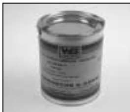
L4.70183.E Paint black similar RAL 9011 Lack schwarz ähnlich RAL 9011