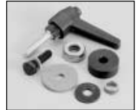
L4.77174.E Stirrup mounting set Bügelbefestigungs-Set