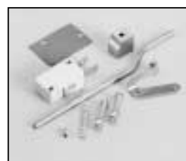
L4.77879.E Safety switch Sicherheitsschalter