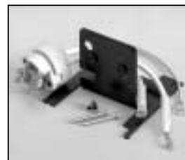
L4.77069.E Lamp holder + lamp carriage cpl. Lampenfassung + Fassungsträger kpl.