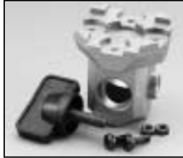
L4.77145.E 16 mm stirrup socket Hülse für Bügel