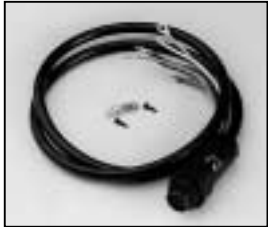
L4.77172.E Mains cable Scheinwerferkabel