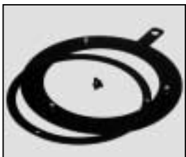
L4.70478SE Lensring s-flood frosted "silver" Linsenring S-Flood gefrostet "silber"