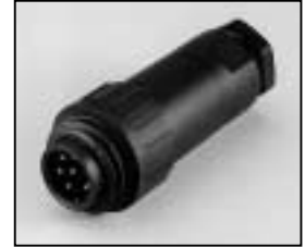
L4.73362.E Connector (Male) Stecker (Stiftkontakt)