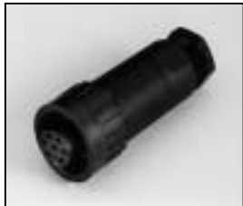
L4.73363.E Connector (Female) Stecker (Buchsenkontakt)