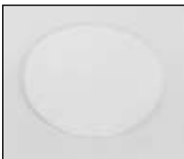
L4.77848.E UV-protective glass (1 pcs.) Sicherheitsglas (1 St.)