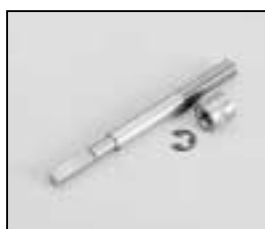
L4.77842.E Focus spindle Fokusspindel