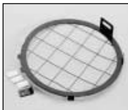
L4.78995.E Wire guard cpl. for 1 protec- tive glass 5mm Schutzgitter kpl. für 1 Schutzglas 5mm