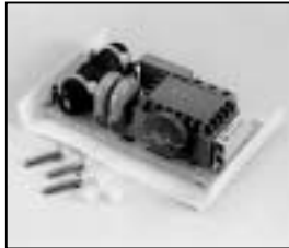
L4.73346.E Ignitor Zündgerät