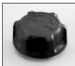
L4.79036.E Focus knob Fokusknopf