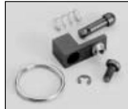
L4.77213.E Lens holder Linsenhalter