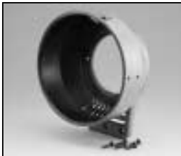
L4.79066.E Front casting Frontteil

NOTE: WHEN ORDERING QUOTE PART NUMBER BEMERKUNG: BEI BESTELLUNG IDENT.-NR. ANGEBEN