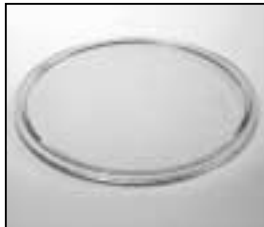
L4.77827.E Spot lens 10° (flat structure) "blue" 130mm Spotlinse 10° (flache Struktur) "blau" 130mm