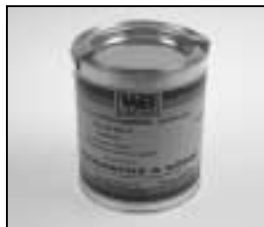
L4.70194.E Paint blue similar RAL 5015 Lack blau ähnlich RAL 5015