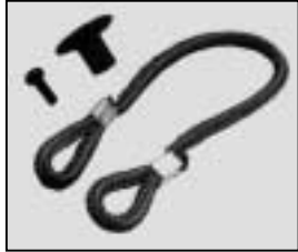
L4.79242.E Cable tie set Halteleine Set