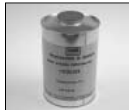
L4.70186.E Paint thinner Farb-Verdünnung