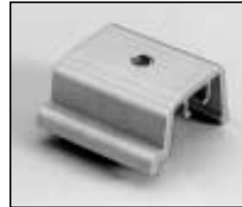
L4.77929.E Stirrup bracket Bügelhalter