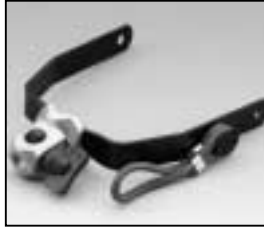
L4.79110.E Stirrup complete Haltebügel komplett