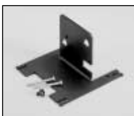
L4.77935.E Lamp carriage Fassungsträger